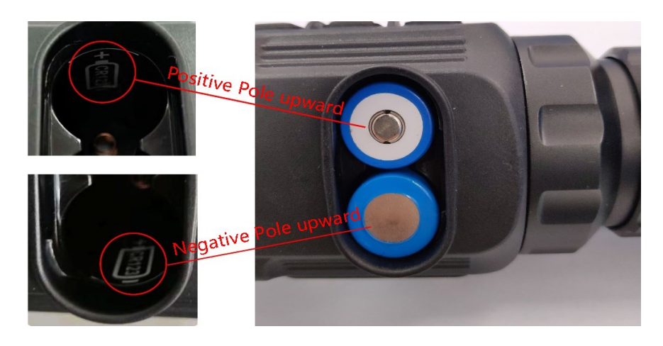
Fig.2 Battery installation

> Open the battery compartment cover anticlockwise according to the