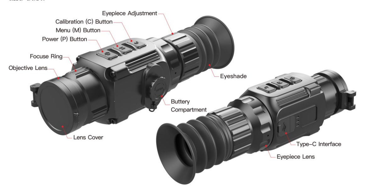
Fig.1 Parts info

The Saim series is a low-cost thermal rifle scope, which can be mounted on various firearms for night hunting and target observation. Its compact size and lightweight design make it easy to carry. What makes it outstanding is long operation hours, good concealment and great ability to detect, recognize and identify objects or targets fast and easy. The Saim series effective at close and long ranges irrespective of light and harsh weather conditions, that is, in total darkness, through heavy smoke, haze, fog, and dust.