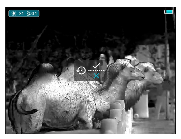
Fig.6 Default resetting interface