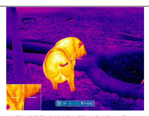
Fig.5 Blind pixel calibration interface