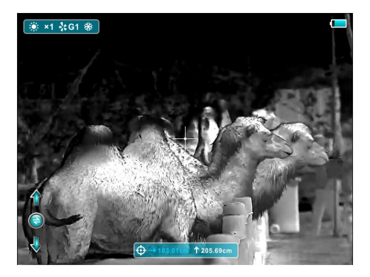
Fig. 4 Zeroing interface

➤ Select the Zeroing item, and press the M button to pop up the Zeroing interface as shown in figure 4. In the Zeroing interface, the reticle is shown as a small cross for position adjustment.